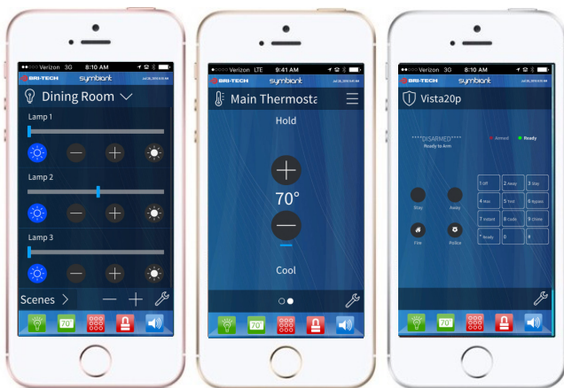
Easy to use smartphone app

We engineered all of these features and control power into the smallest space possible. Instead of a rack of electronics, Symbiant is built in a recessible wall panel. You don't have to lose a closet for your technology.